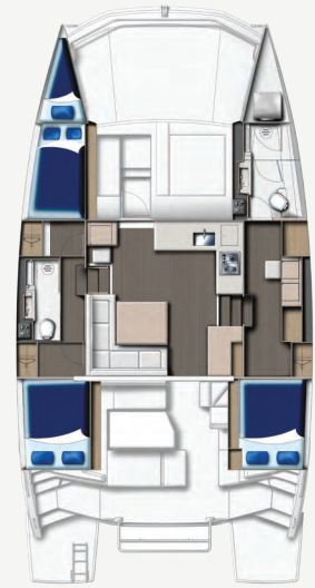
433PC - Lower Deck