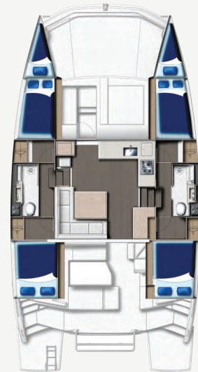
434PC - Lower Deck