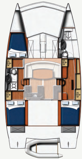
393PC - Lower Deck